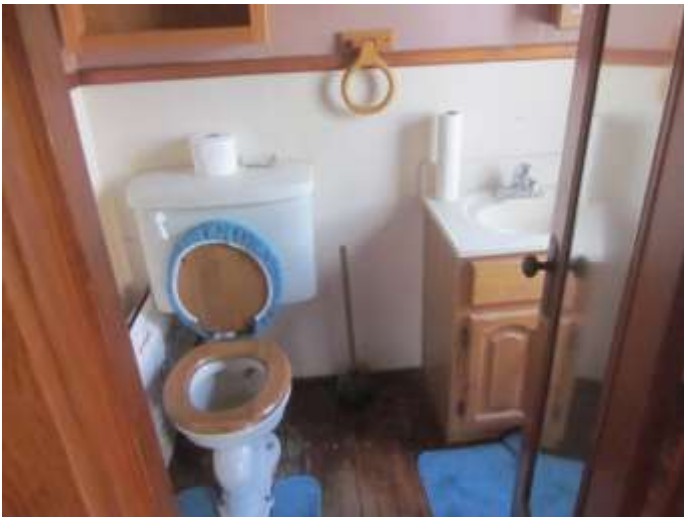
Half bath off of main floor bedroom