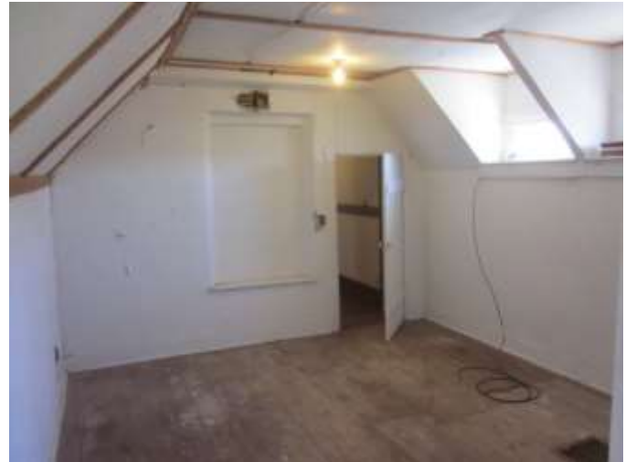
Opposing views potential 4 th 2 nd floor bedroom