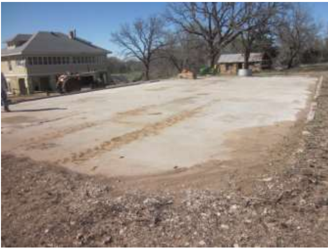
40' x 70' Slab from removed shed with electrical service, great for parking camper or equipment