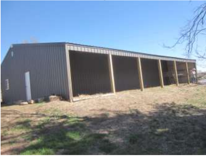
Cleary building west side