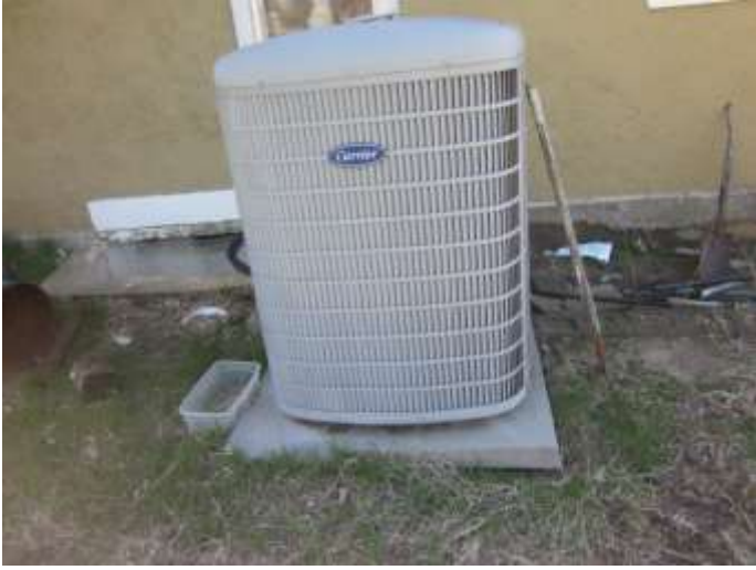
Newer AC unit