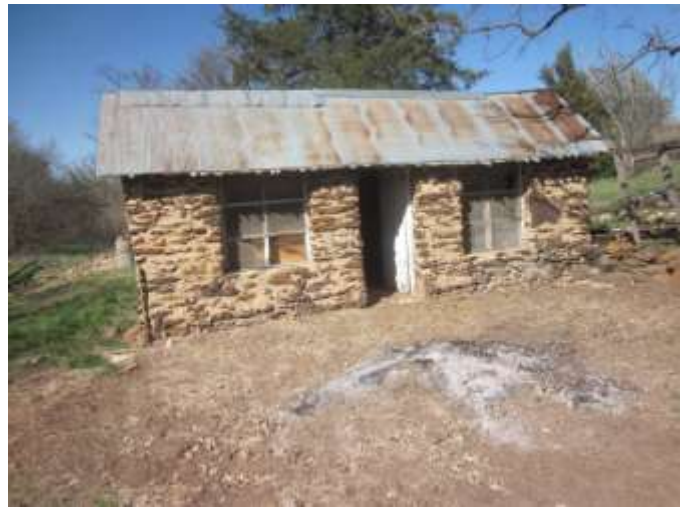
One of 2 rock buildings on property, used as chicken house.

Any announcement made the day of sale takes precedence over any printed matter.