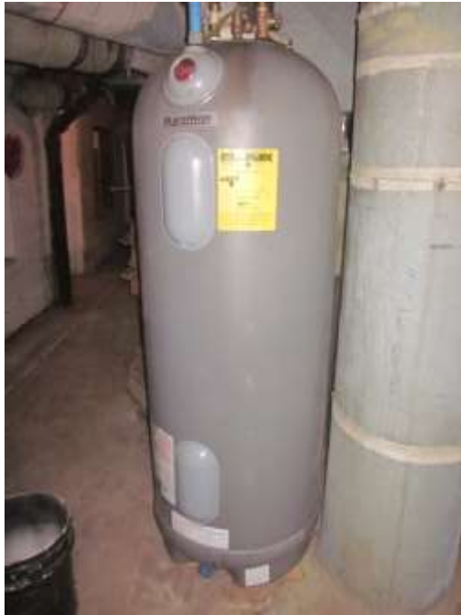
Rheem Marathon high efficiency water heater