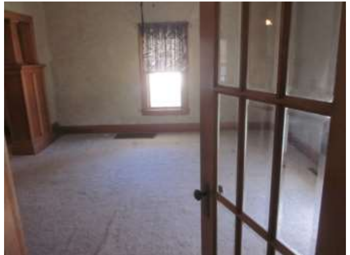
Family room (notice beveled glass doors and built in shelves to left which is entrance to entry/front room but picture wasn't useable)