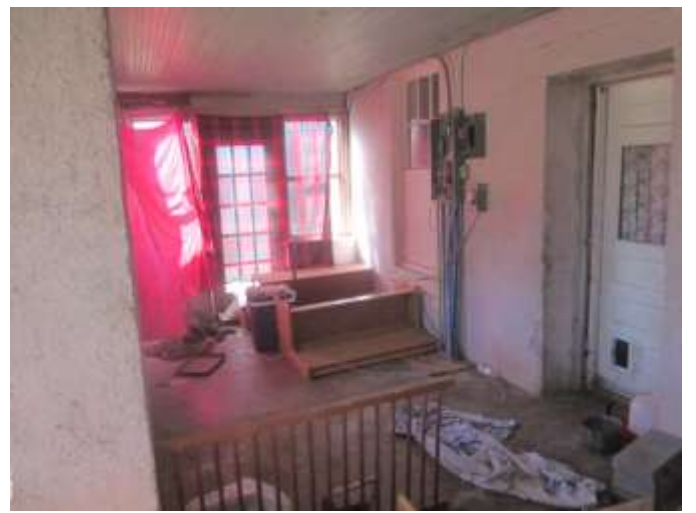
Same covered south side porch (door to kitchen)