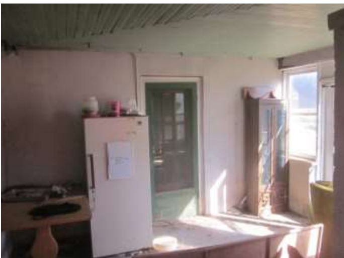
Covered south side porch (door to 1 st floor hallway)