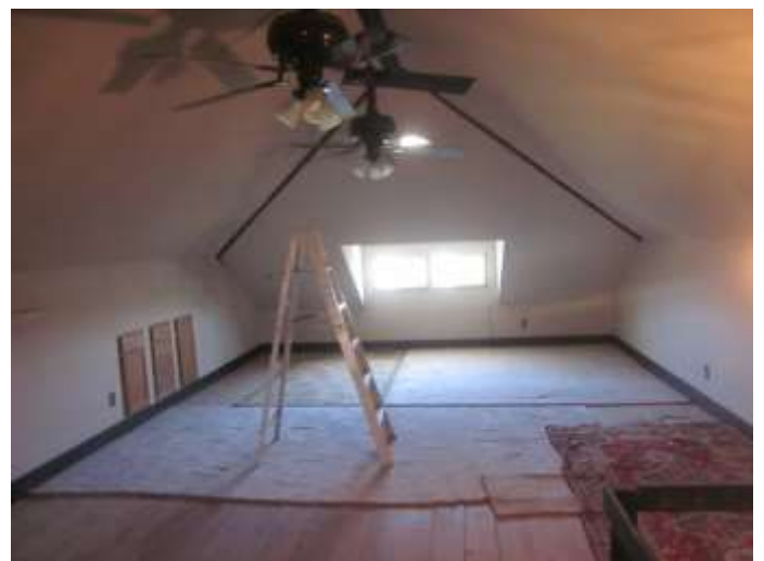
Opposing views 3 rd floor rec room/play room/potential 6 th bedroom