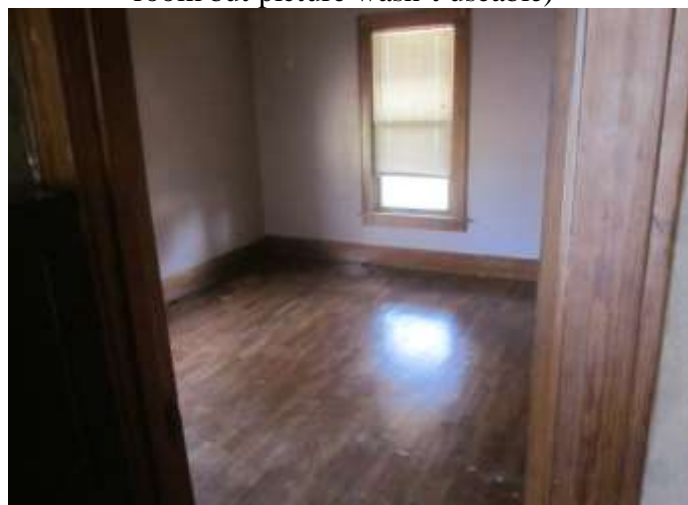
Main floor bedroom