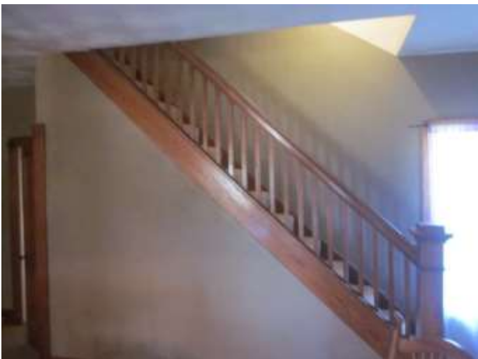
Open stairway to 2 nd floor