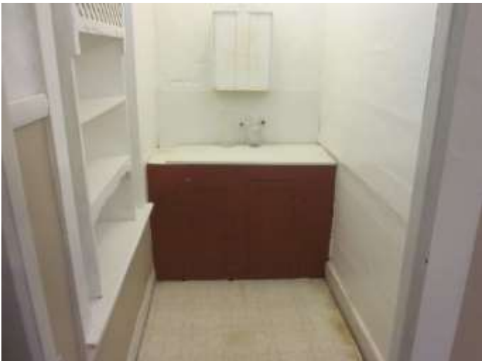
Off of kitchen is a wash room