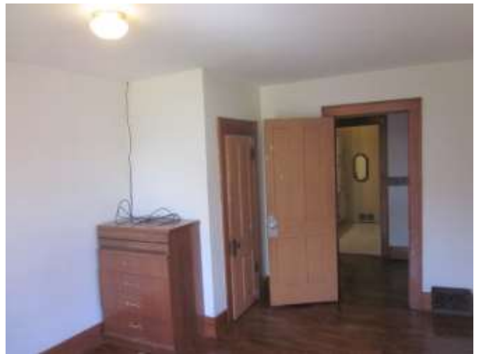
Opposing views 3rd 2 nd floor bedroom