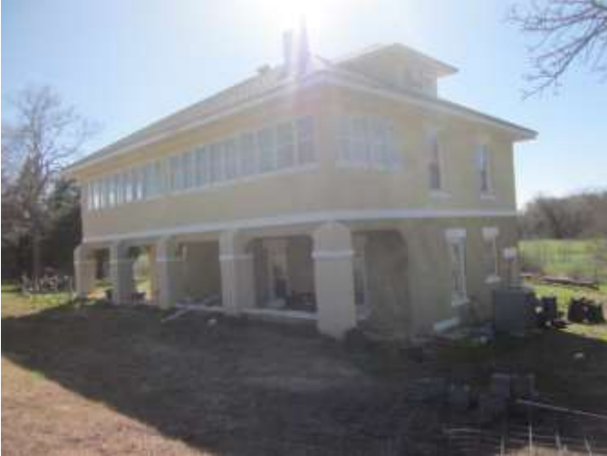
Front of house faces east