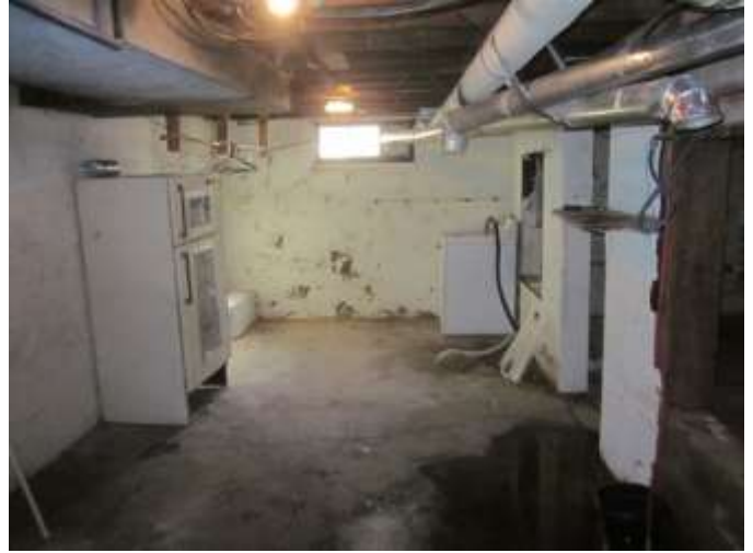
Basement reported to be generally dry Water is from faucet for washing machine leaking when removed, will be repaired