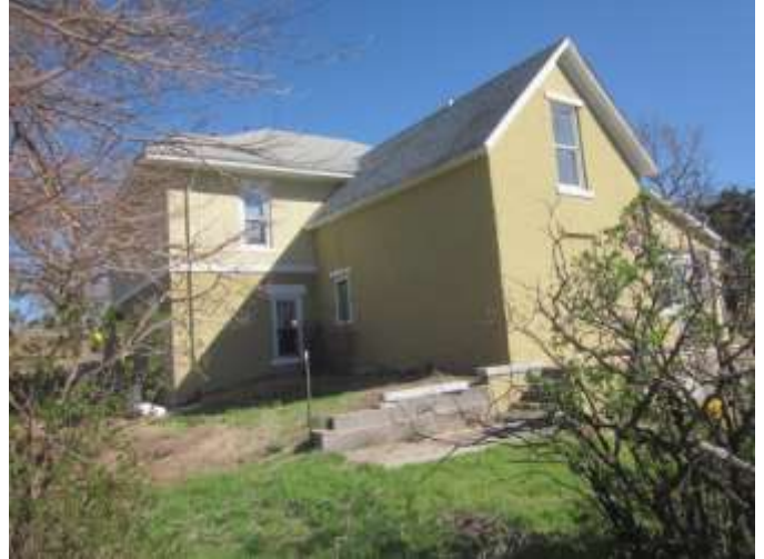
Northwest corner of house