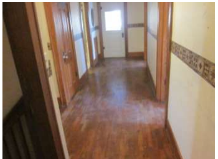
2 nd floor landing