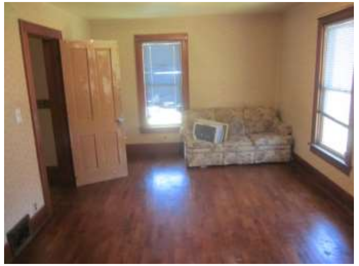
Opposing views 1st 2 nd floor bedroom