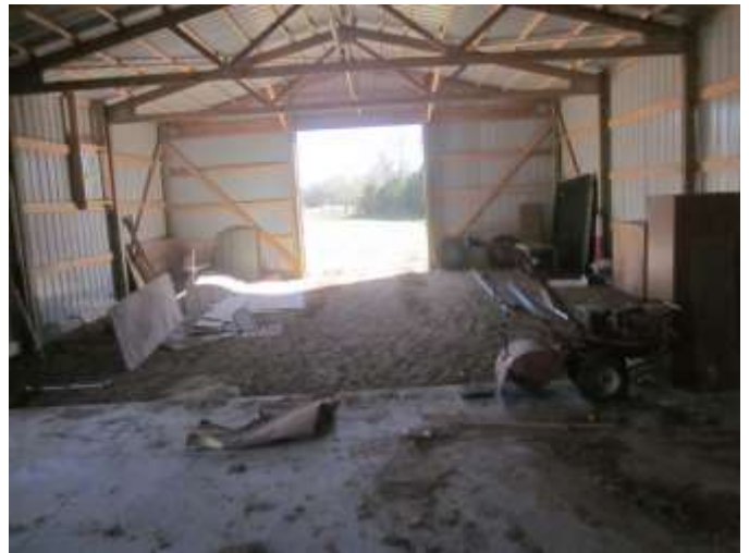
Cleary building inside