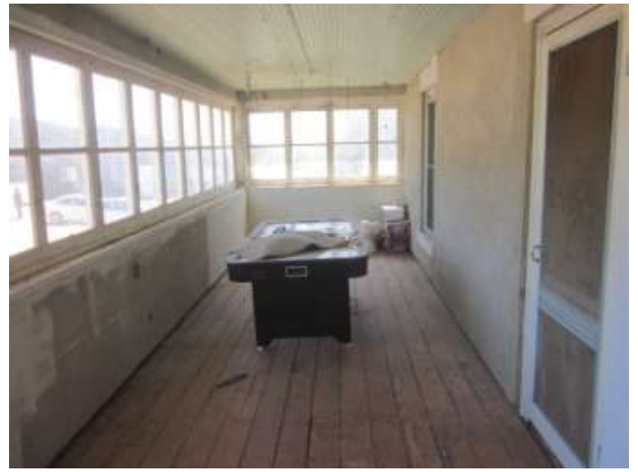
Opposing views 2 nd floor sun porch