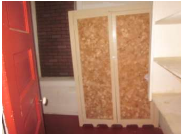
Off of kitchen is a pantry