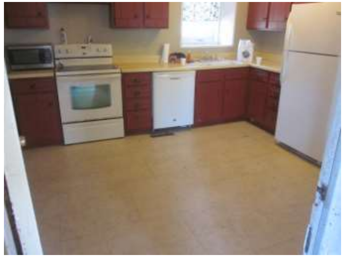
Kitchen – pictured appliances sell with house