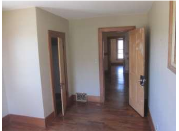
Opposing views 2nd 2 nd floor bedroom