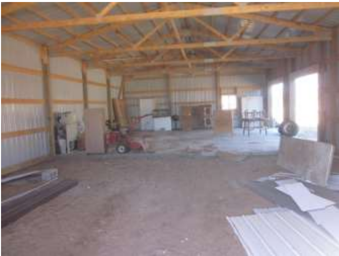
Cleary building inside