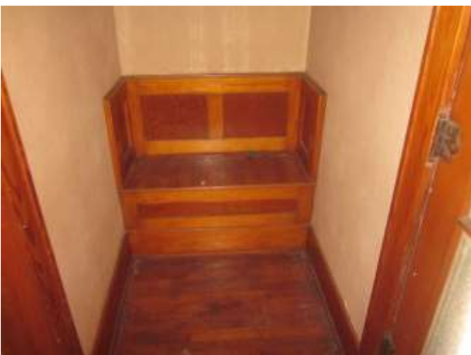
Another built in is this bench at the end of downstairs hallway