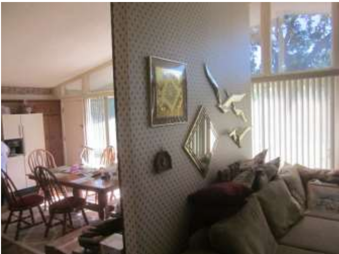
Dividing wall, glass wall continues across rear of house