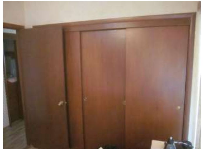
All bedrooms feature large closets