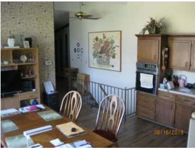
Stairs to basement