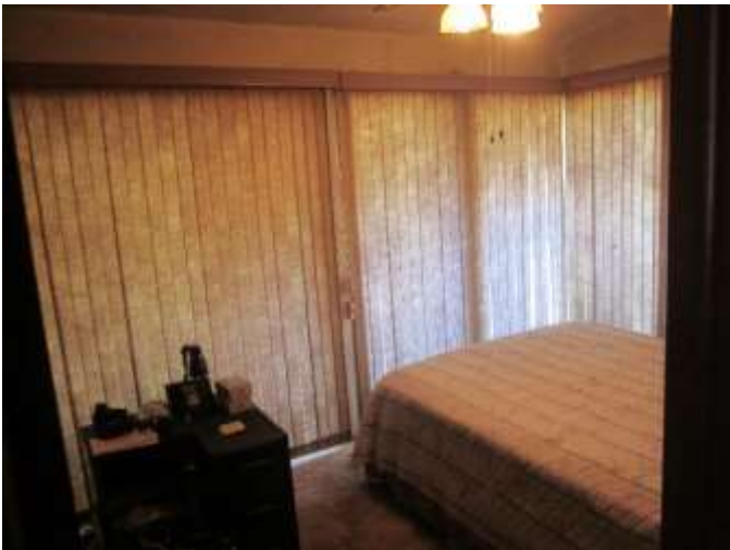
Bedroom # 2