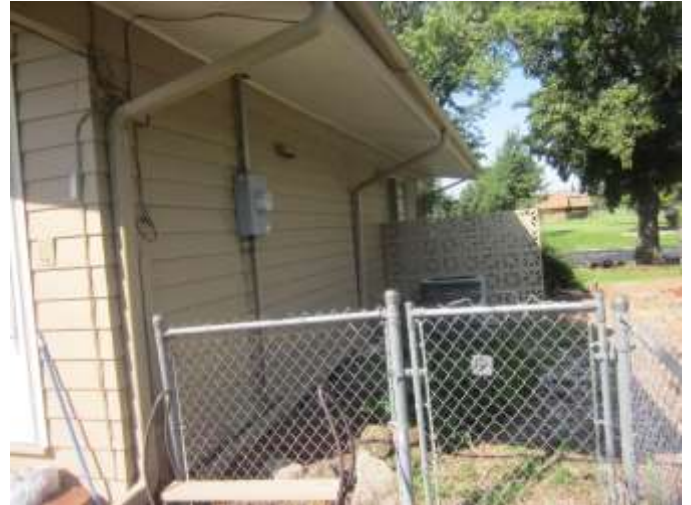
North side of house from back yard