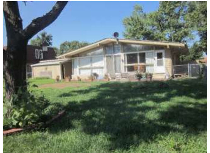
Rear of house from back yard