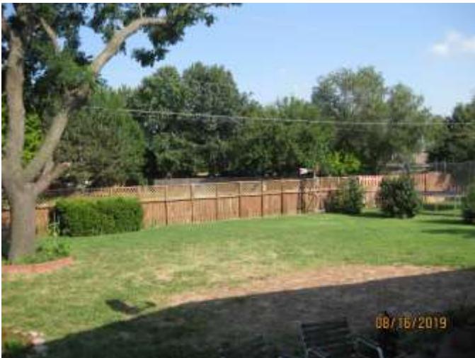
Back yard from house