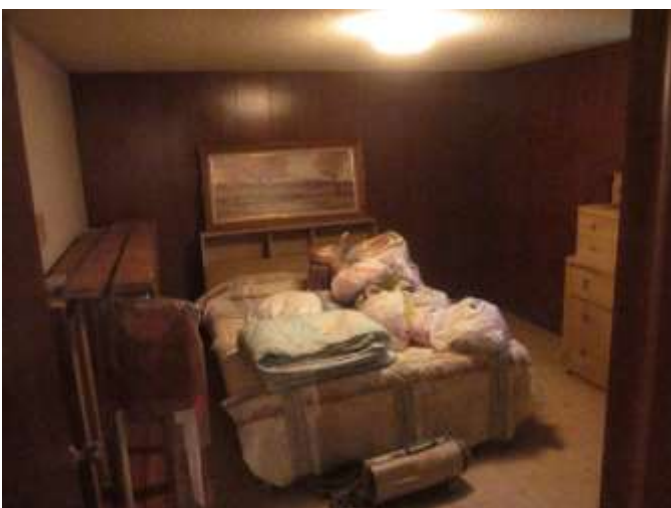
Non-code bedroom in basement also has large closet