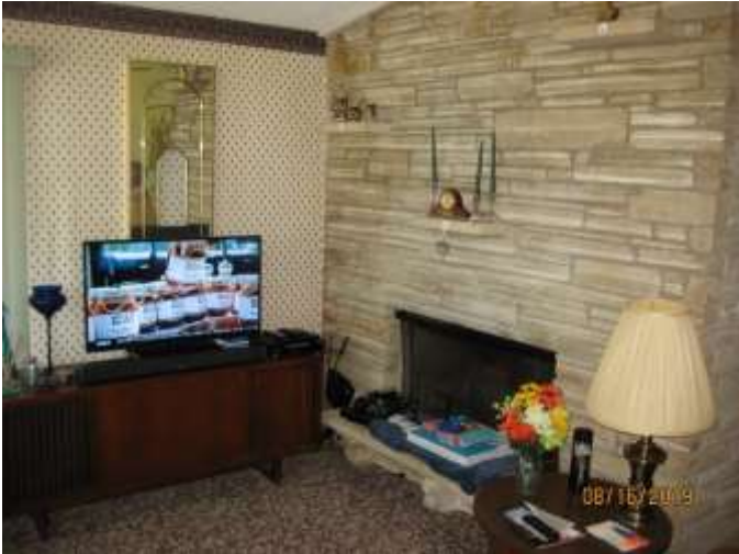
Living room with fireplace