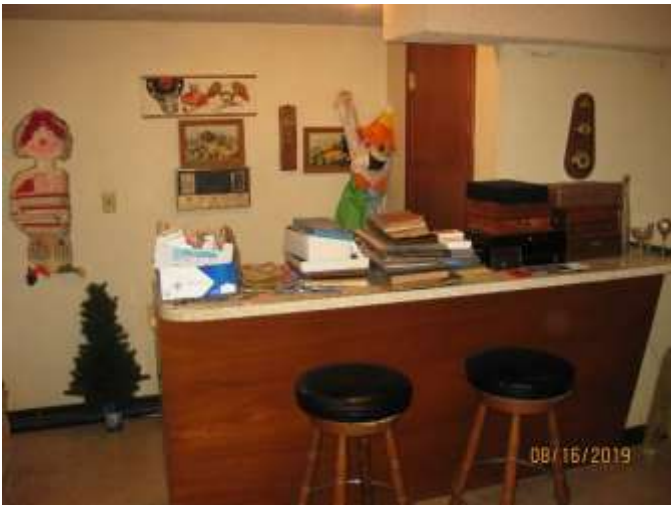
Basement has bar area