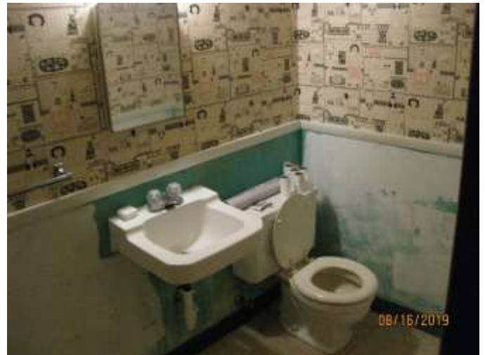
Basement 1/2 bath