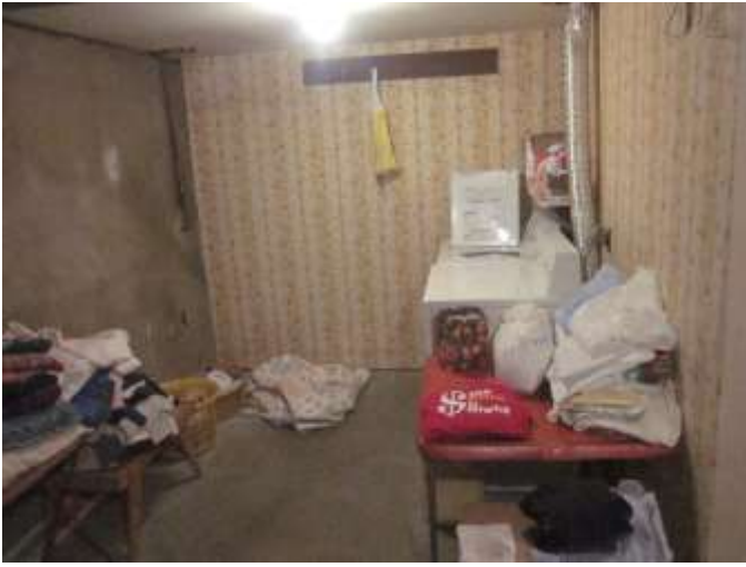
Basement laundry room