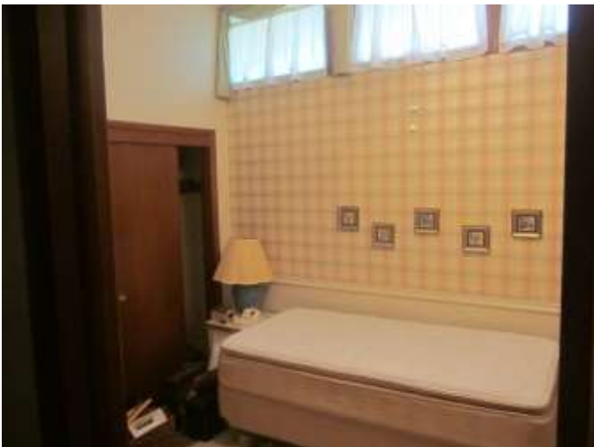
Bedroom # 3