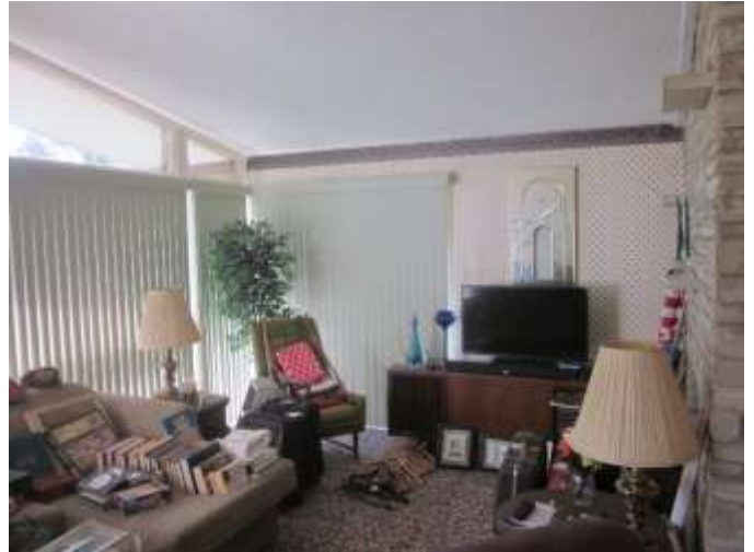
Living room, beginning of glass wall across rear of house