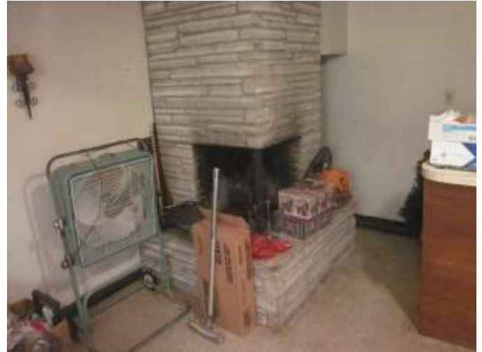
Fireplace in basement