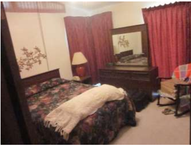
Master bedroom includes walk-in closet