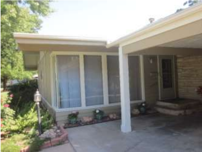
Front entry off of driveway/carport