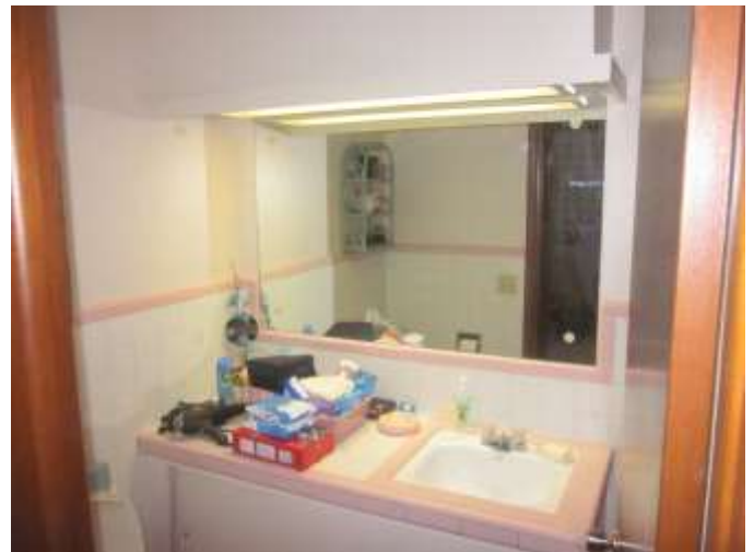
Main floor full bath