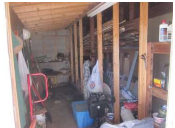
Carport storage area