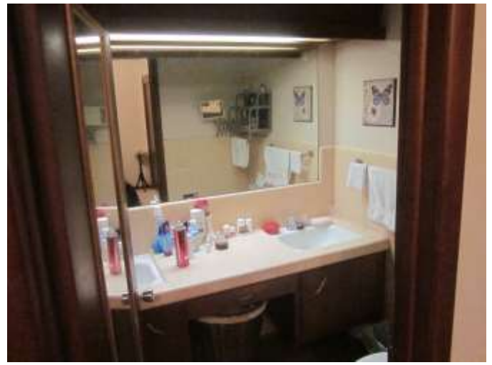
Master bedroom en suite ¾ bath includes shower