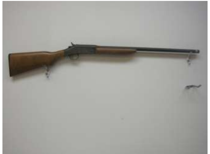
H&R mod. 88 Topper Jr 20 ga single shot shotgun ser # AX541874