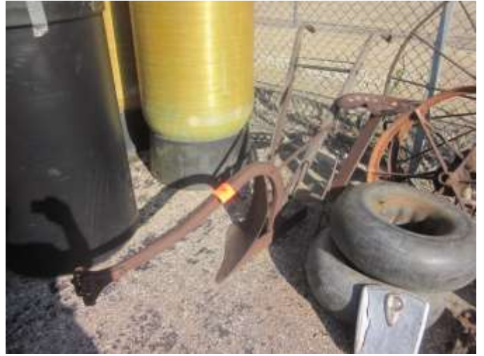
Horse drawn plow, implement seat