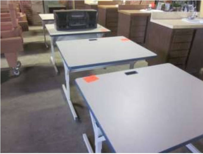
(4) Computer tables

Any announcement made the day of sale takes precedence over any printed matter.