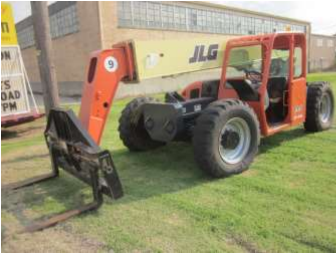
JLG G9-43A 4x4x4 telehandler 43' reach 9000 lb capacity