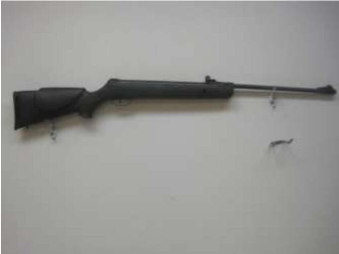
Shadow 1000 .177 pellet rifle