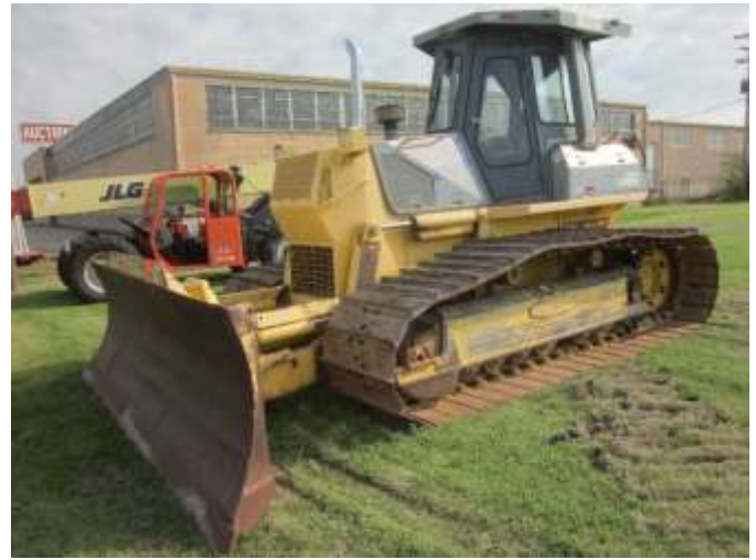
Komatsu D61PX dozer 34" wide steel tracks 152" wide blade 5450 hrs