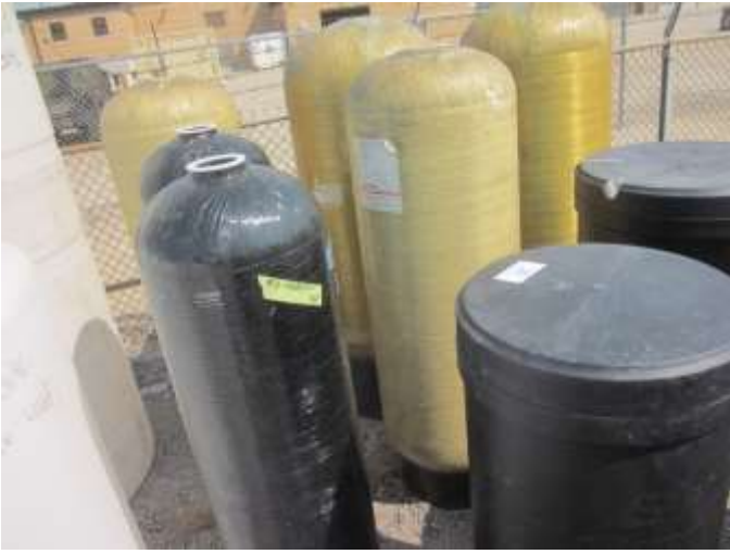
(6) Fiberglass tanks