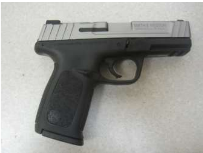
Smith & Wesson mod. SD9 VE 9mm semi auto pistol stainless slide 4" bbl NIB ser # FB01181