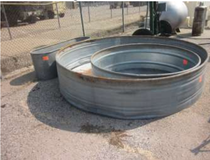
6' & 9' round, 6' x 2' oval stock tanks