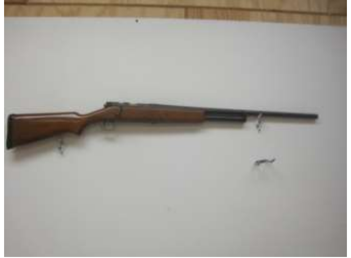
JC Higgins mod. 583-2 16 ga 2-3/4" chamber bolt action shotgun full choke bbl ser # N/A