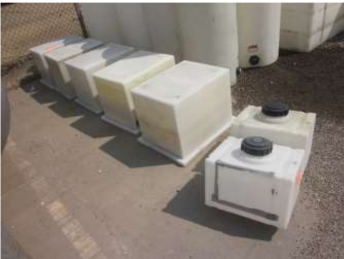
(5) poly sinks, (2) small poly tanks