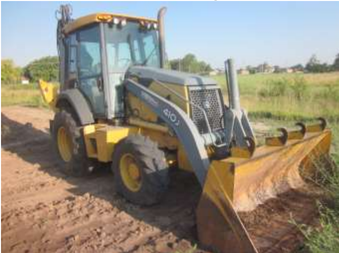
John Deere 410J Loader Backhoe w/extendahoe quick coupler, 4wd front wheel assist, 91" loader bucket, 35" backhoe bucket, heat & air, 2624 hrs ser # TO410JX143227