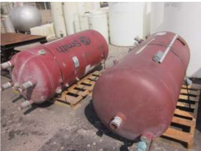
(2) 200 gal A.O.Smith hot water tanks