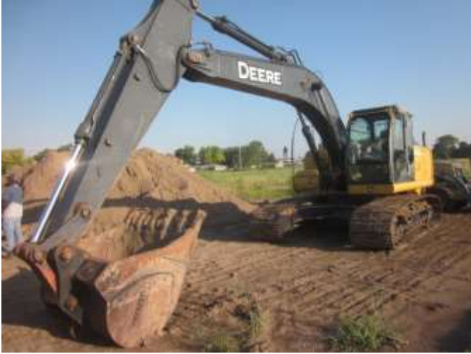
2003? John Deere 200D LC excavator, 32" wide track, 54" bucket, heat & air good, 3813 hrs ser # FF200DX510139