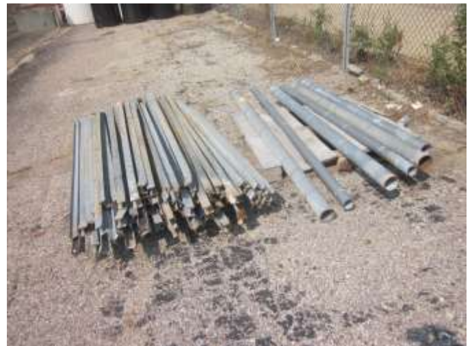
(4) 4" & (2) 3" galvanized round pipe 7'+ long appx 70 2" x 2-1/4" I-beams 6'-7' long