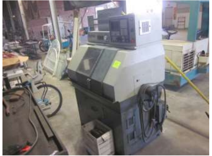
Upgrade Technologies mod. Accu-Tune GT-27 CNC lathe