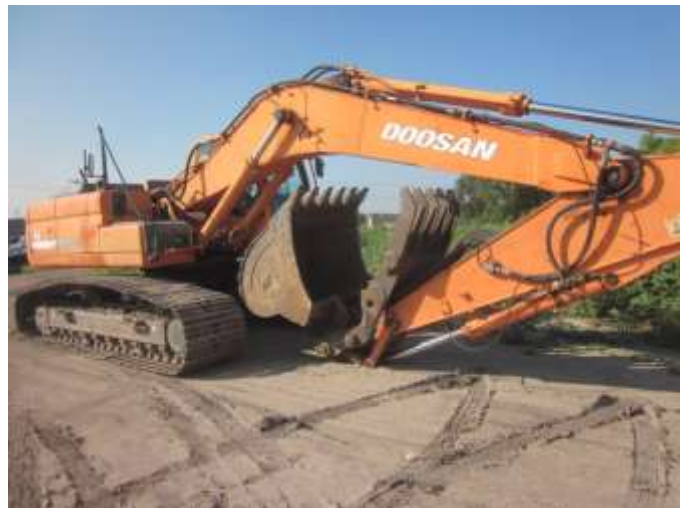
Doosan DX255LC excavator 32" wide track w/LGP grouser pads, 47" grapple bucket with 2-way hydraulics & hydraulic thumb, cab heat & air ser # DHKHEBF0T70005101