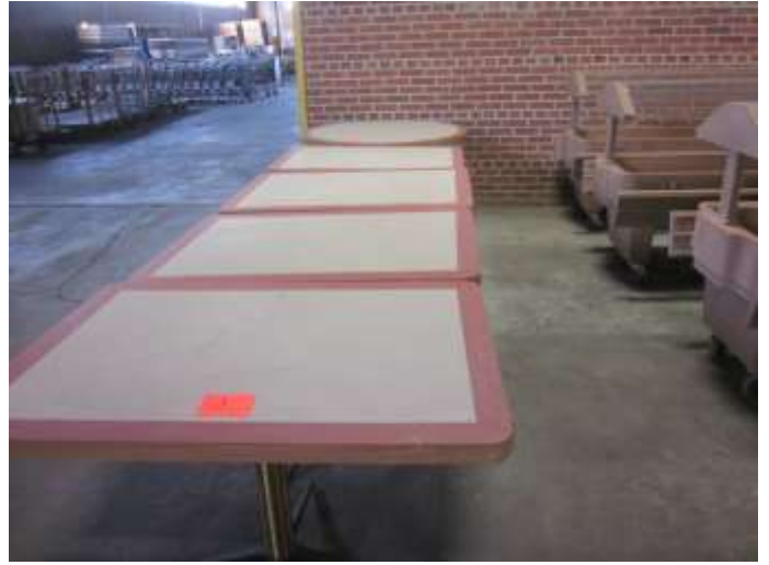
(5) pedestal tables