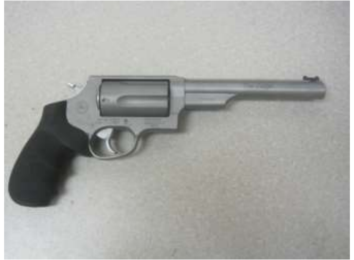
Taurus mod. The Judge 45 Colt/410 5-shot revolver 10" bbl stainless ser # KV312168