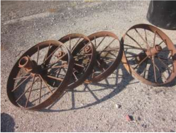
Steel & iron wheels