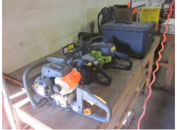
Ryobi HT26 gas powered hedge trimmer McCulloch MS1435 35cc 14" chainsaw Poulan P3314 33cc 14" chainsaw Craftsman 35cc 16" chainsaw in case