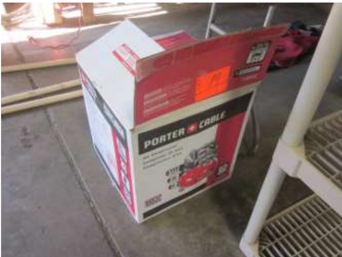
Porter Cable 6 gal pancake air compressor NIB