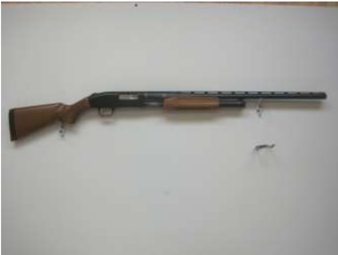
Mossberg mod. 500A 12 ga 2-3/4" & 3" chamber pump shotgun w/28" vented bbl, shell tubes & Duck + Turkey tubes ser # R719681