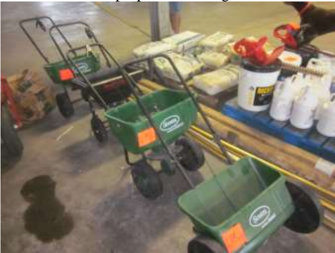
(4) Broadcast spreaders