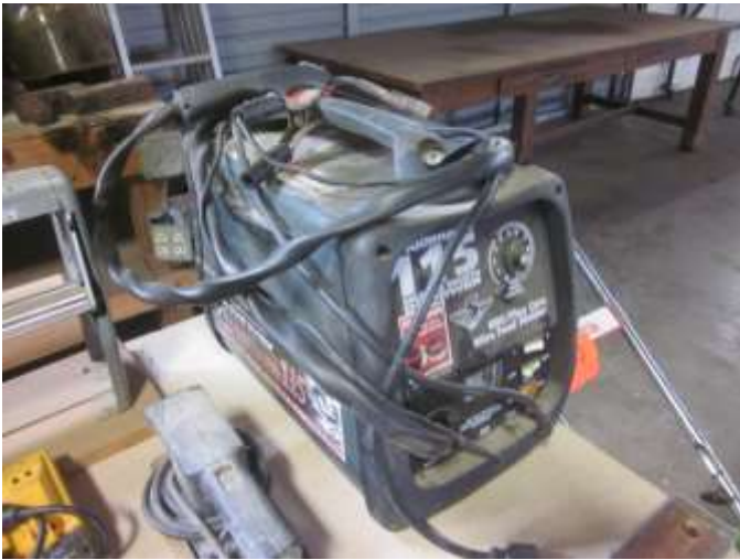
Farmhand 115 MIG/Flux Core wire feed welder