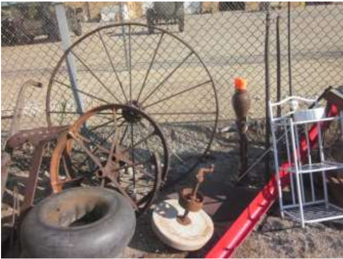
Wheels, well pump, grind stone