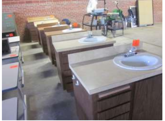
(6) Vanities w/sinks & faucets