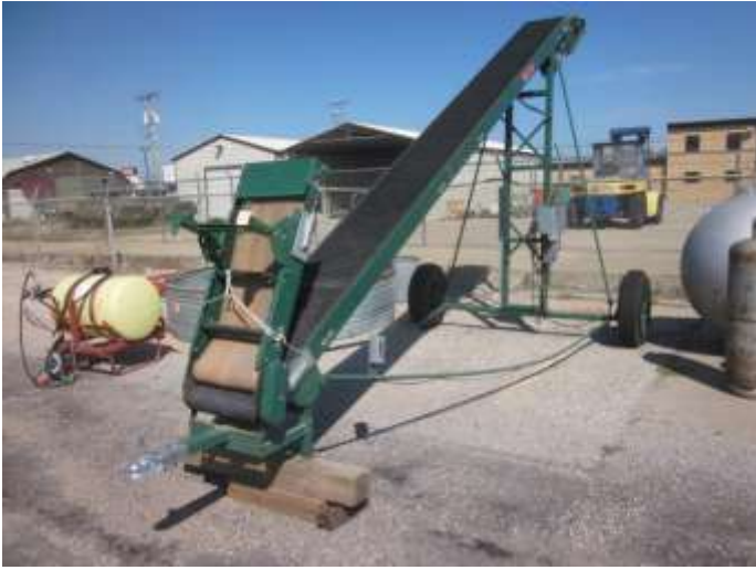
Rapistan incline conveyor on trailer