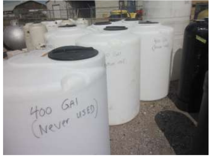
(6) 400 gal white poly tanks NEW 750 gal white poly tank