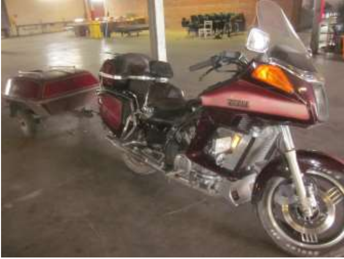
1984 Yamaha Ventura motorcycle w/fairing, helmet & saddle bags, matching custom trailer