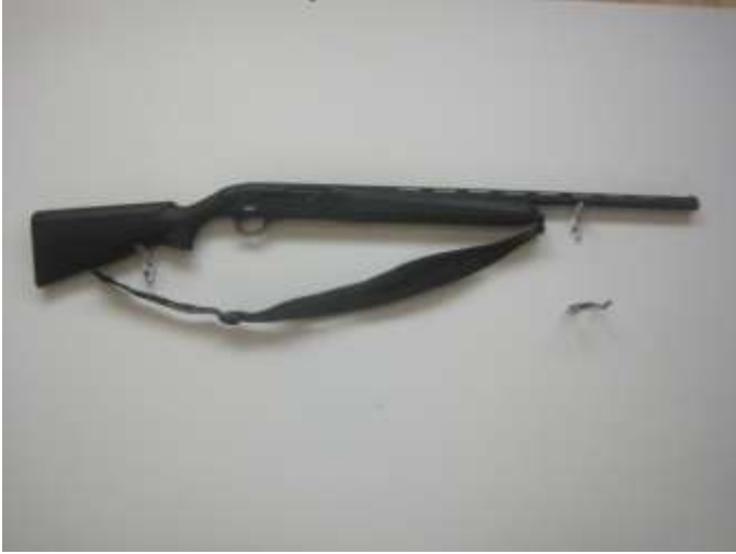
Tri-Star mod. Raptor 20 ga 3" chamber semi auto shotgun w/vent rib, sling, 2 extra choke tubes ser # KRA041566