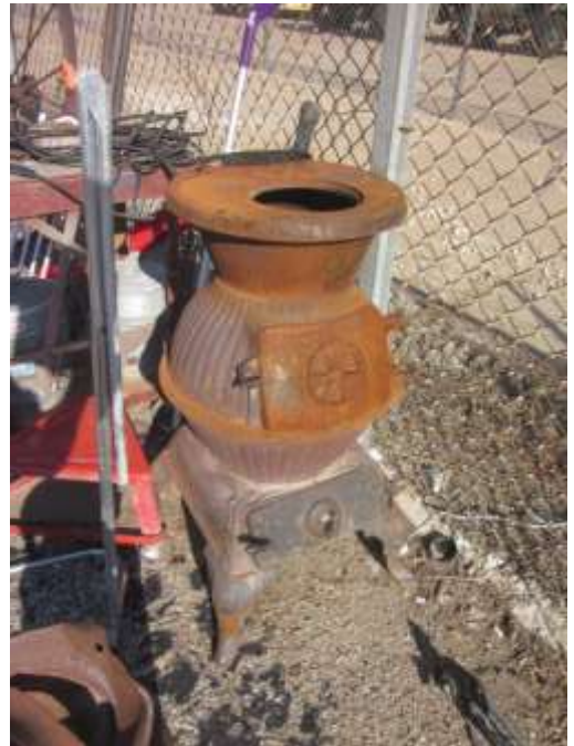
Harmony cast iron stove