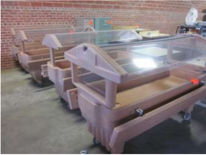
(4) Child size food bars w/tray slides & sneeze guards