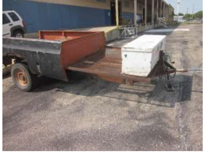
Pickup bed trailer w/tool box