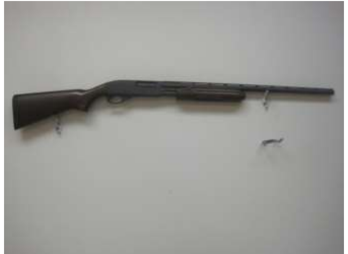
Remington mod. 870 20 ga 2-3/4" & 3" chamber pump shotgun w/ vent rib & choke tube ser # CC95221A