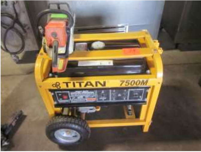
Titan 7500M gasoline generator