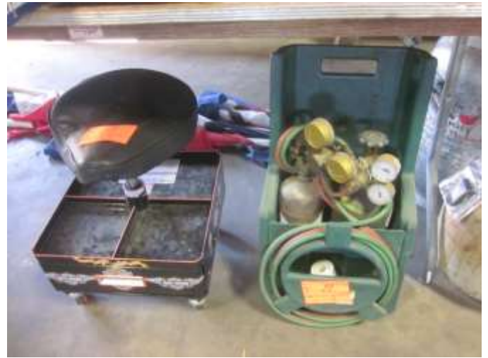
Harley-Davidson rolling seat/tool storage plumbers torch kit