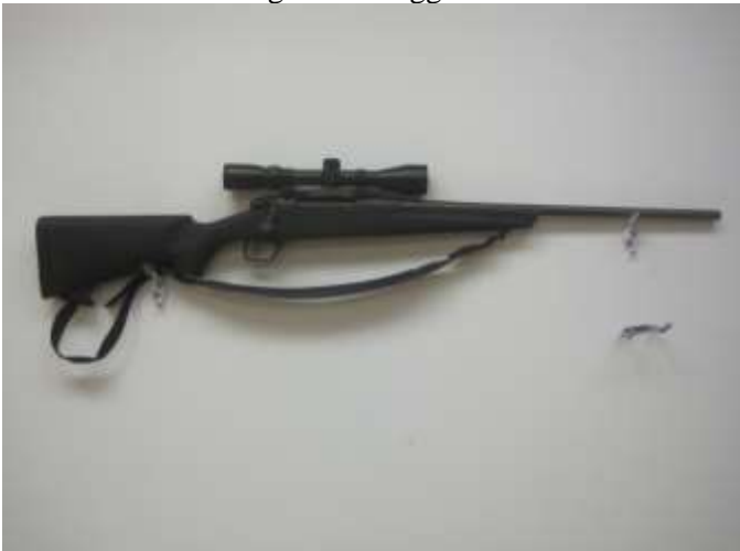
Remington mod. 783 270 WIN cal bolt action rifle 22" bbl 4-rd mag w/3-9x40 scope & sling ser # RM32367F