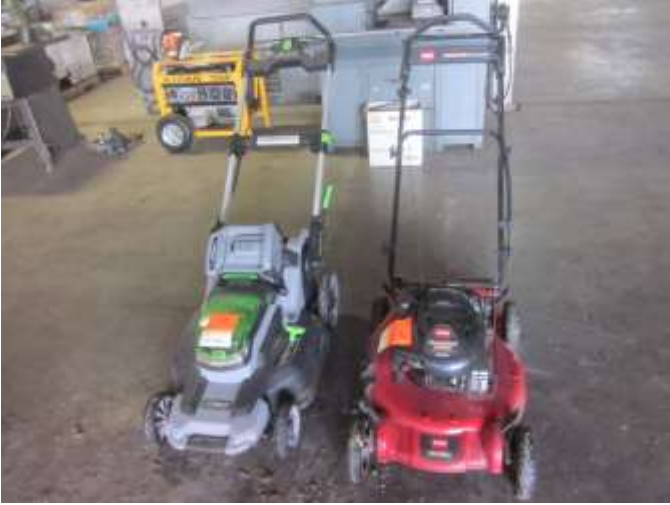
EGO 56v electric mower w/charger (no battery) Toro self-propelled rear bag mower