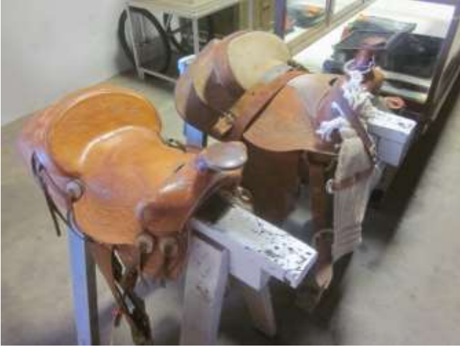
(2) Western style saddles