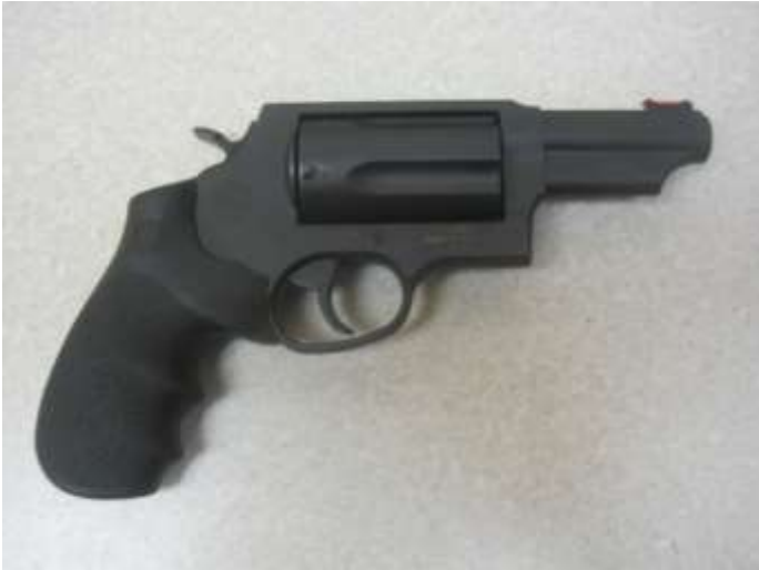
Taurus mod. The Judge 45 cal/410 5-shot revolver 3" bbl ser # 1Z204041