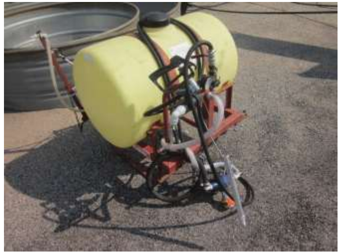
3-pt Kuker 55 gal sprayer w/pump