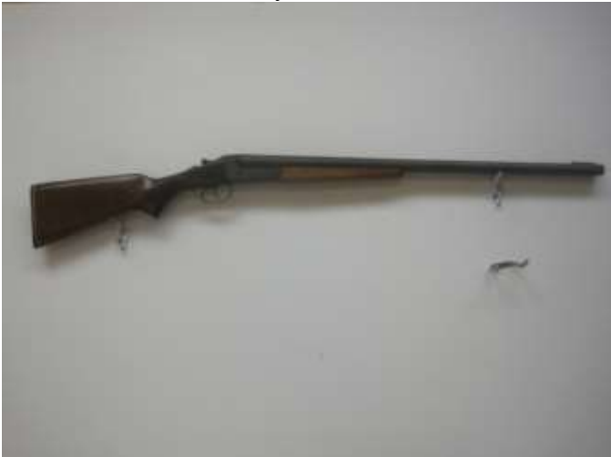
Stevens mod. 311-Series H 12 ga 2-3/4" & 3" chamber double bbl shotgun w/2 triggers ser # B041425