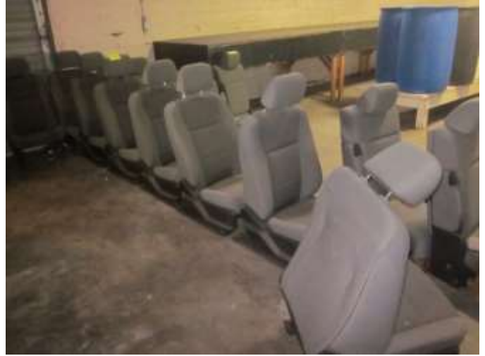
New van & truck seats (standard seats ElDorado pulled from new vehicles and upgraded)