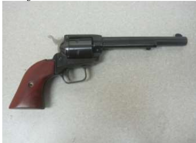
Heritage mod. RR22MB6 22 cal revolver 6.5" bbl (has both 22 LR & 22 MAG cylinders) ser # P50926