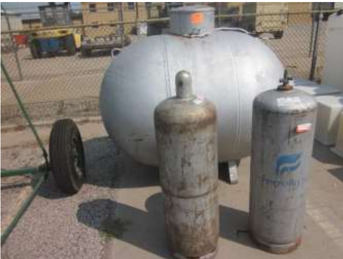
500 gal propane tank & (2) 100 lb propane bottles