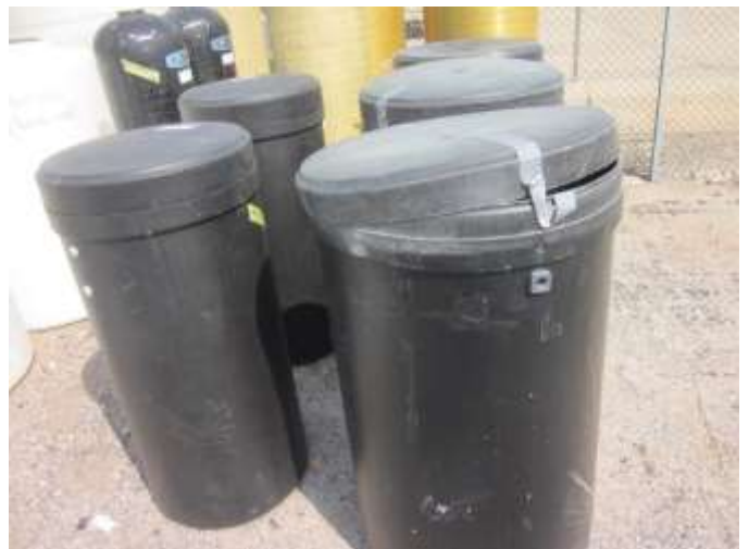
(5) Black poly tanks