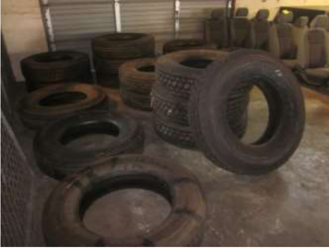
NEW truck tires – (4) ROADPRO R610 11R22.5, (3) IRONMAN I-601 285/75R24.5, (2) IRONMAN I-109 295/75R22.5, (2) IRONMAN I-109 11R22.5 (2) IRONMAN I-208 295/75R22.5, SUPERCARGO SC02 11R24.5, IRONMAN I-601 11R22.5, IRONMAN I-109 285/75R24.5