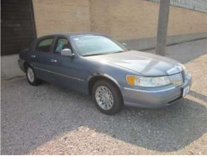
1999 Lincoln Town Car Signature series V8 4.6L engine