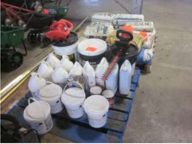
Drywall & tile adhesive, mortar, etc