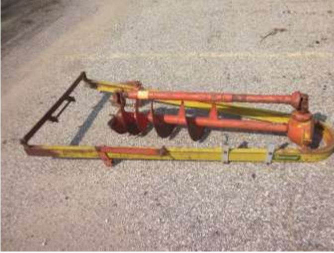
Kim's Fast-O-Matic post hole digger