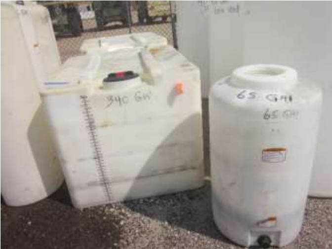
65 gal round & (2) 340 gal block tanks