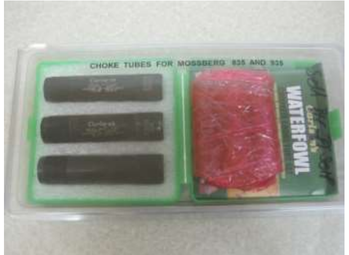
Choke tubes for Mossberg 835 & 935 12 ga