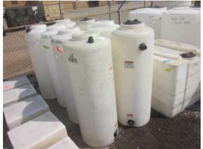
(8) 105 gal poly tanks