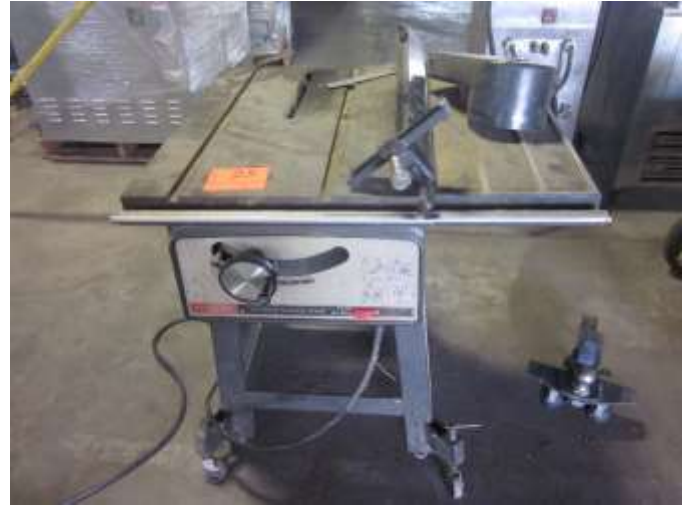
Craftsman 10" bench saw on stand