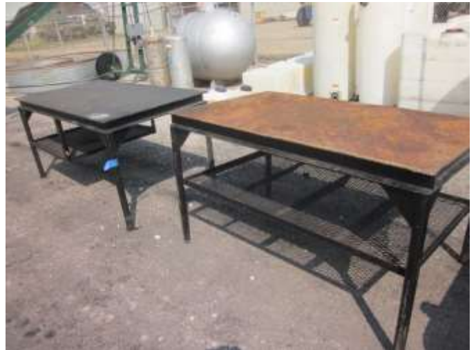
2 metal shop tables